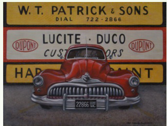
"Joy Ride" ~ $450

A lifelong resident of the Virginia Peninsula, I was born and raised in Hampton and currently reside in Newport News. A realistic painter, I paint solely for the joy it brings me - there are no deep meanings or hidden messages in my works. I currently work exclusively in acrylics depicting a wide range of subject matter - mostly things that 'speak' to me as I encounter them. The works I have selected for display at James River include some of the subjects I enjoy painting most.