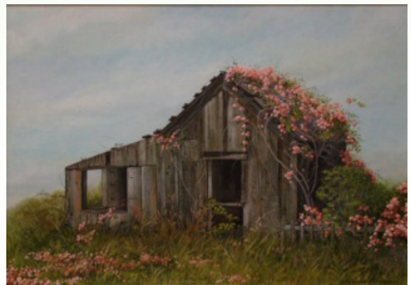
"Sugar Shack" ~ NFS