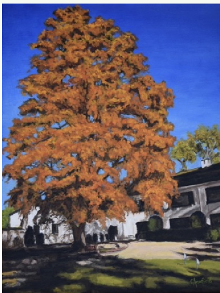
"Cypress Tree on the Putting Green of JRCC" 14"x18; oil on canvas; $450.00