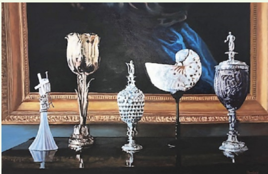
"5 Objects Still Life from 'Civilization Renaissance' Segment TV Series" – 36"x24"; oil on canvas; $2,800.00