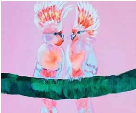
"1st Year Anniversary" – $270