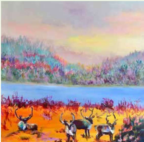
"Elks" – $600