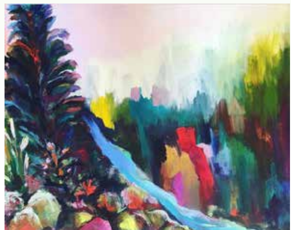
"Secret Stream" – $280