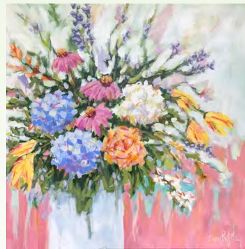
"Morning Bouquet" – $500