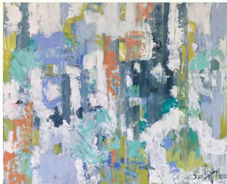
"Rainy Day Downtown" – $400