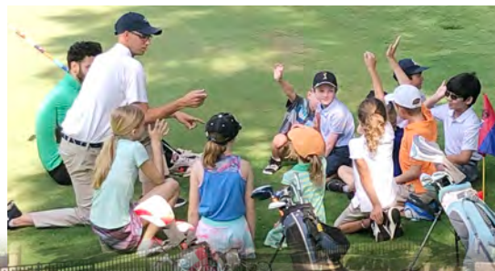
Junior Golf FUNdamentals Golf Camp