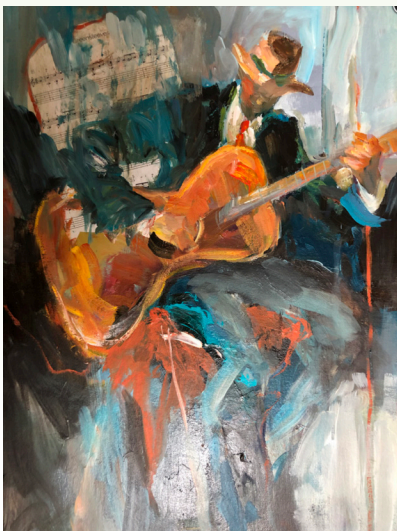
Man with a Blue Guitar Plays Greensleaves 24x18