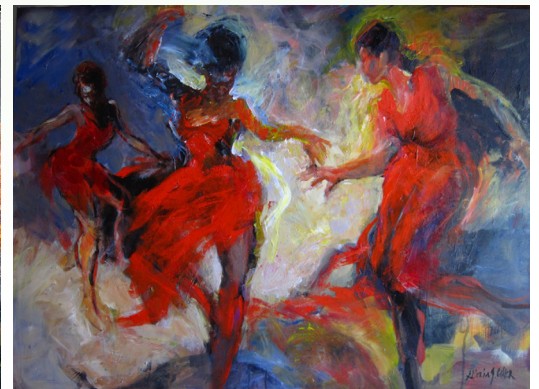
Red Dancers – 30x40