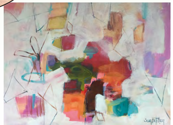
"Above it All" – $575