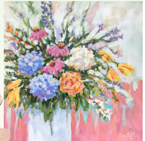
"Morning Bouquet" – $500