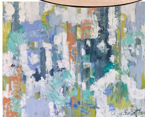
"Rainy Day Downtown" – $400