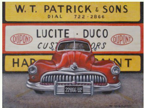
"Joy Ride" ~ $450

A lifelong resident of the Virginia Peninsula, I was born and raised in Hampton and currently reside in Newport News. A realistic painter, I paint solely for the joy it brings me - there are no deep meanings or hidden messages in my works. I currently work exclusively in acrylics depicting a wide range of subject matter - mostly things that 'speak' to me as I encounter them. The works I have selected for display at James River include some of the subjects I enjoy painting most.