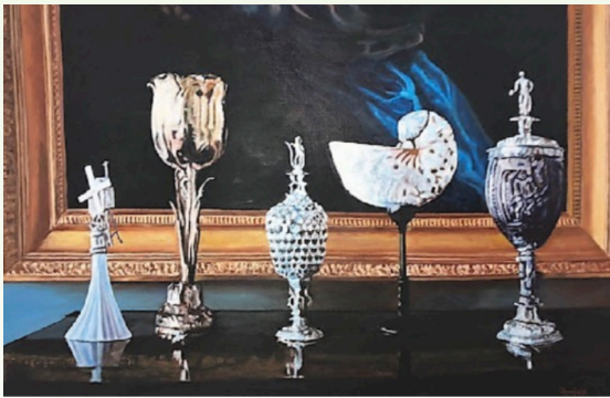
"5 Objects Still Life from 'Civilization Renaissance' Segment TV Series" – 36"x24"; oil on canvas; $2,800.00

Mr. Armfield's paintings can be seen in the Gallery section on his website: https://carmfieldfinearts.com