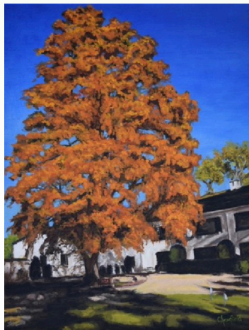
"Cypress Tree on the Putting Green of JRCC" 14"x18; oil on canvas; $450.00