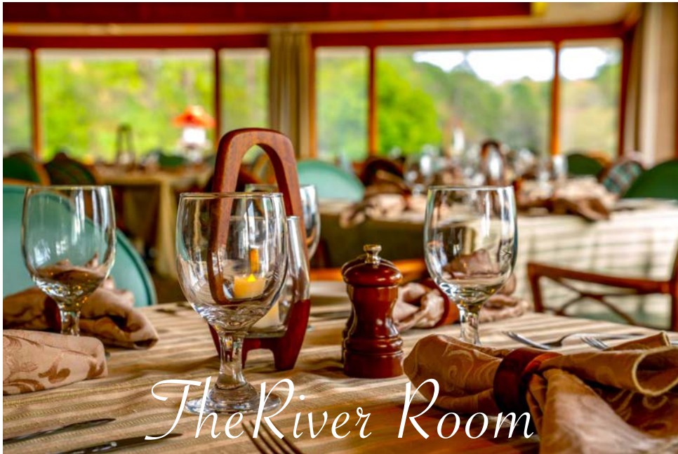
The River Room