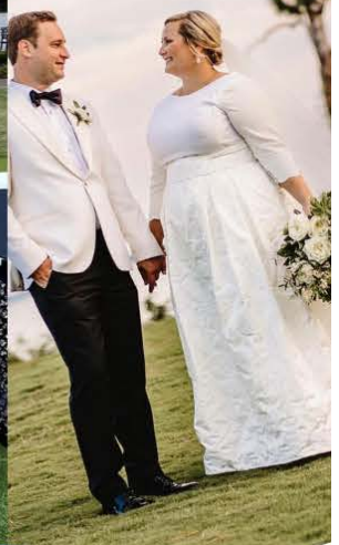
Photo Entry Club