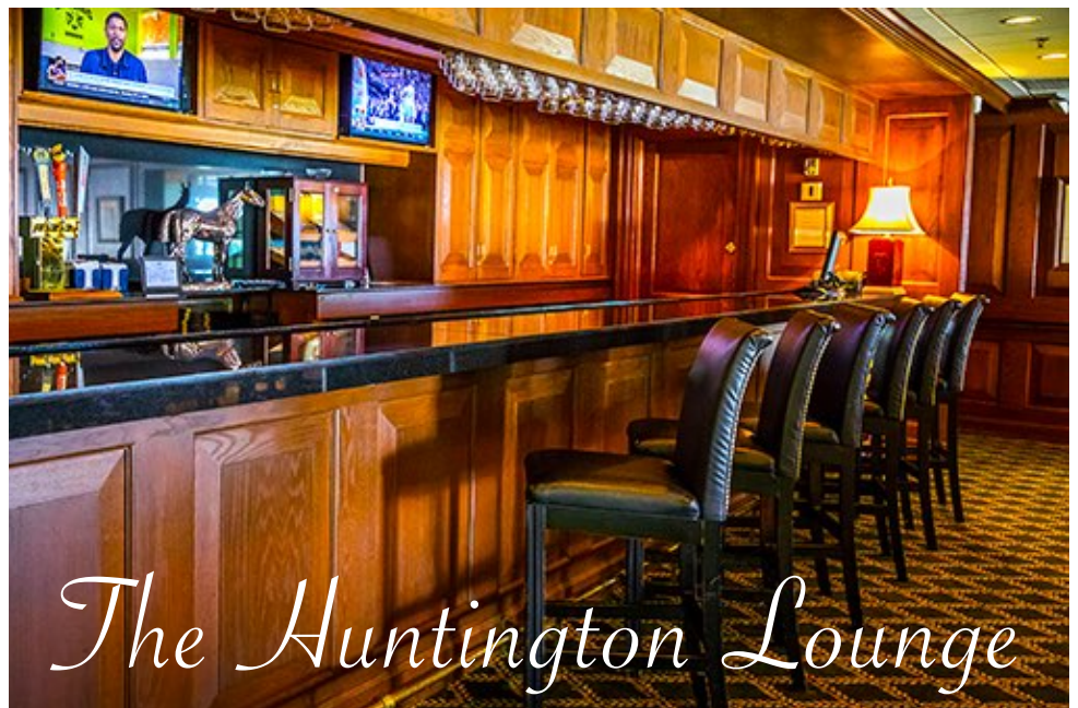
The Huntington Lounge