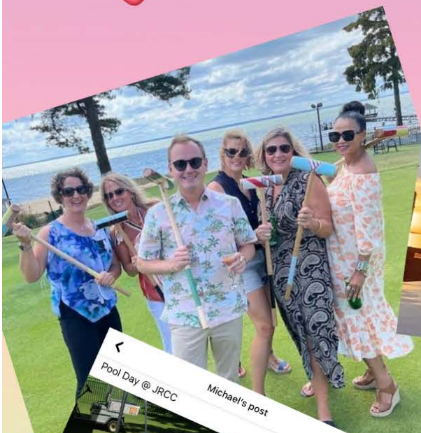
Pool Day @ JRCC Michael's post