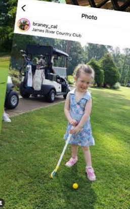
James River Country Club