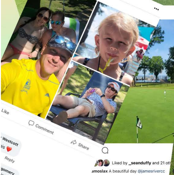
Like Comment Share Westcott is Reply gomery Liked by _seanduffy and 21 others amoslax A beautiful day @jamesrivercc